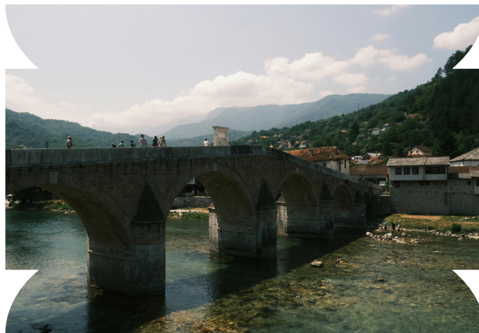
Konjic Bridge, Herzegovina-Neretva Canton

The improvements already achieved in representation of women in BiH are due to prior changes to the electoral law including ratcheting up the percentage of women on the lists as well as requiring that the 40% be reflected throughout the list. The electoral law could be changed to require that 50% of candidates on each party list be women and that women and men would have to be alternated on the list. In their analysis, the UNDP finds that making this change alone would probably have a positive impact on the representation of women , but that the amount of the impact is uncertain. This has the advantage of setting an expectation for equal representation, but voters would still be able to use the open list system to leapfrog over women.